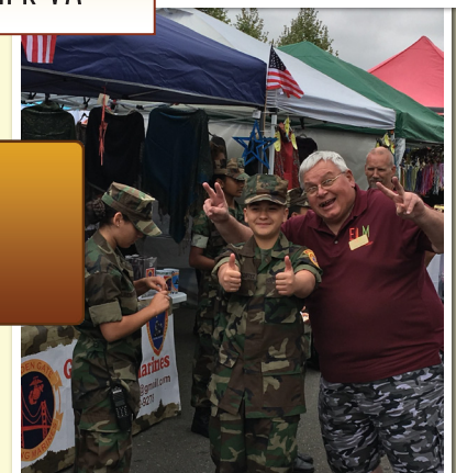
Fall Festival 2019