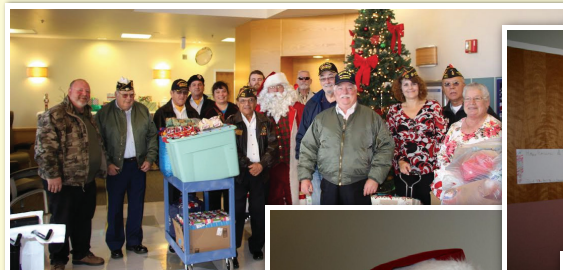
Presenting Gifts & Visiting Vets at Livermore VA