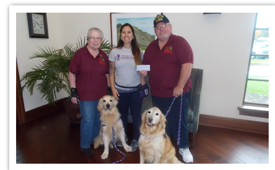
ELLM Donates to Paws for Purple Hearts