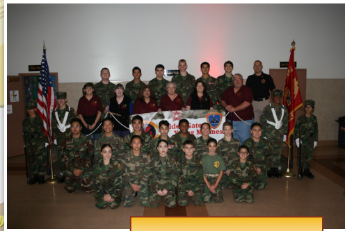
Crab Feed 2019

ELLM Donates Time and Funds at Christmas, Easter and Throughout the Year