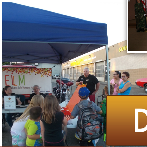
Cruise Night 2019