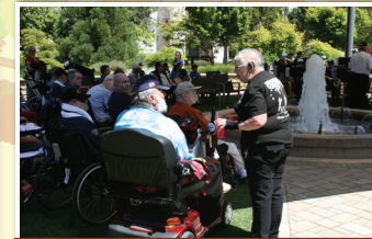
Root Beer Floats at Menlo Park VA